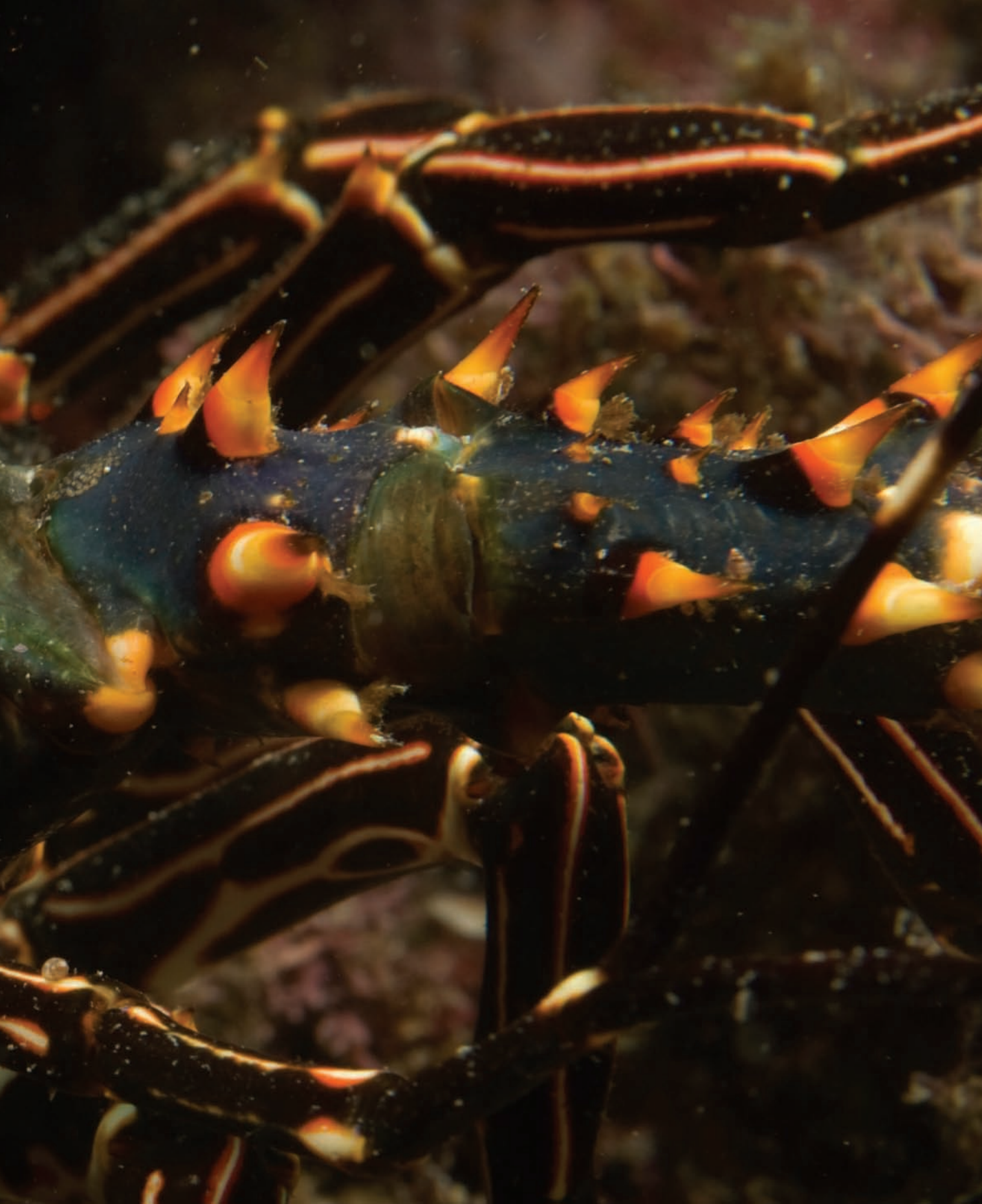
Blue lobster Panulirus inflatus , a species of great commercial value.