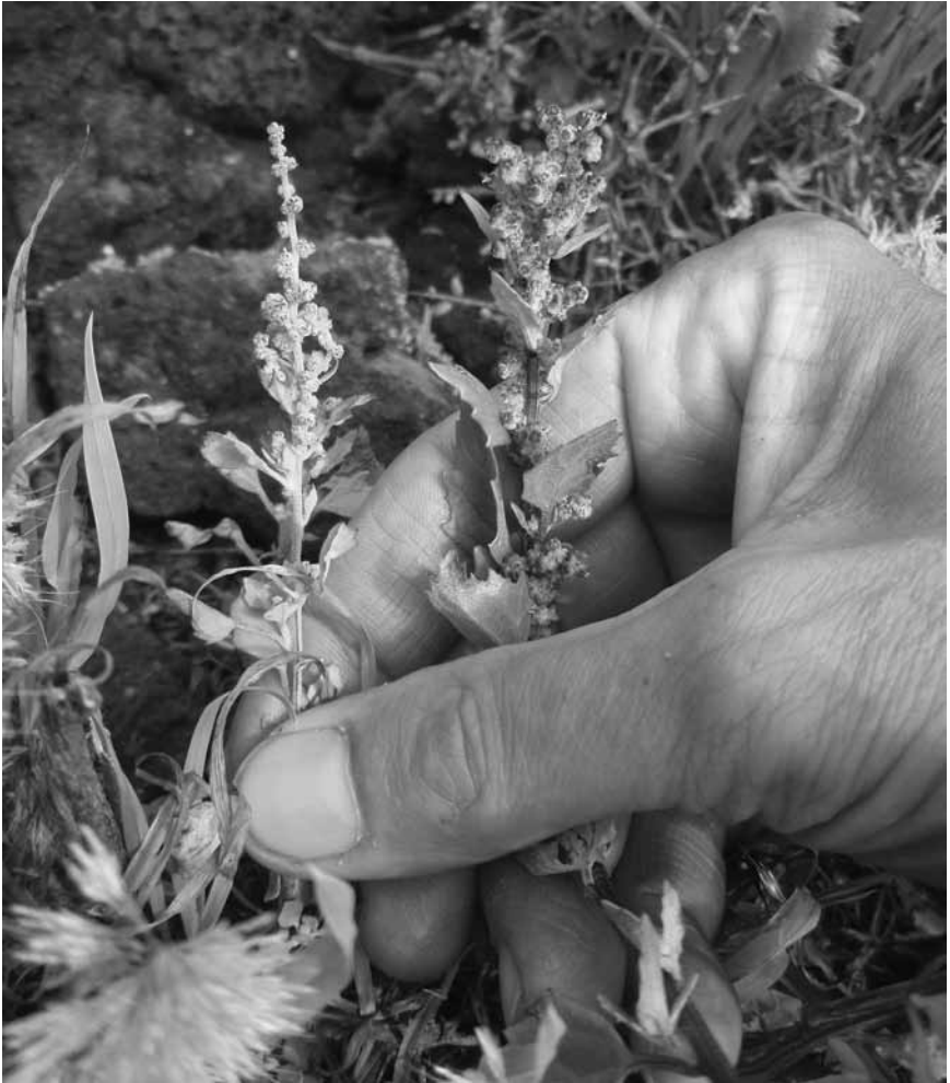
Figure 1: Chenopodium flabellifolium (left) as compared to the weedy invasive Chenopodium murale (right). Photo: S. Vanderplank, 2009.