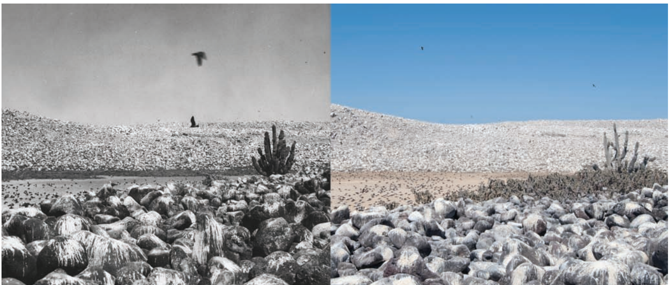
Figure 6. (left) Rodney Hastings photo m33-20, 15 March 1971; and (right) match by Thor Morales, 15 April 2012.

may be attributed to the eradication of the non-native rodents in 1995. There has been increased survival of seedling and small cardones, the cholla expansion may in part be due to release from predation of newly established clones, and the two new species ( Rhizophora and Viscainoa ) arrived post-eradication. The response of the seabird breeding populations has been remarkable since the rodent eradication. The Elegant Terns, in particular, increased from 30,000 individuals in pre-eradication years to 200,000 in 1999, and have remained high ever since (Velarde and Ez-