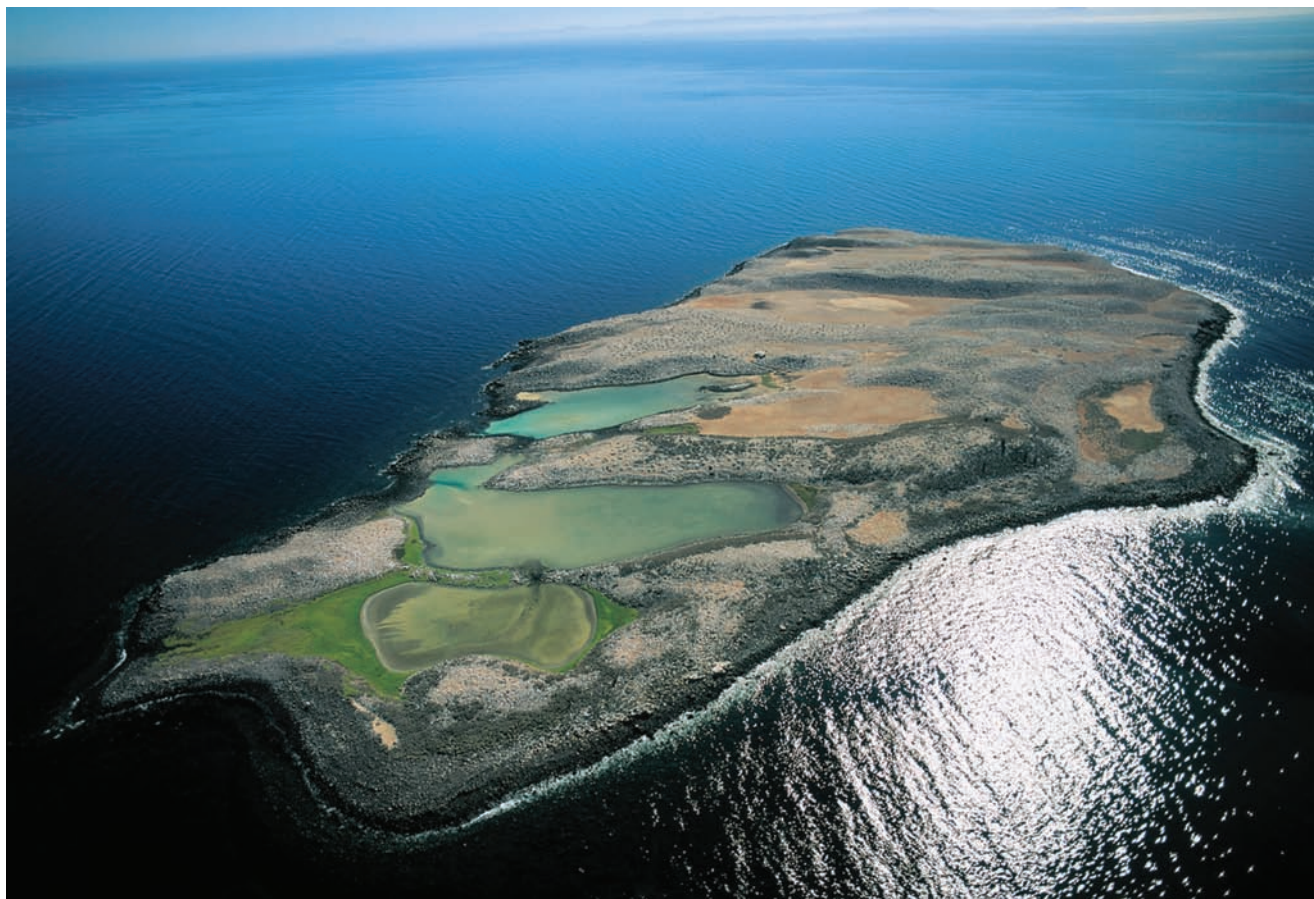
Figure 2. Aerial photograph of Isla Rasa; view looks to the northeast.

aching 50,000 eggs per year (Villa, 1976). Egg collection was practiced by local Baja California people who, in order to obtain fresh eggs for market, would travel to the island in small boats during the start of the laying season and destroy all eggs they could find so that the birds would lay fresh eggs (without developed embryos). A few days later they would collect the fresh eggs and take them to their towns for sale. This practice continued until 1964 when Rasa was given federal protection as a wildlife reserve.