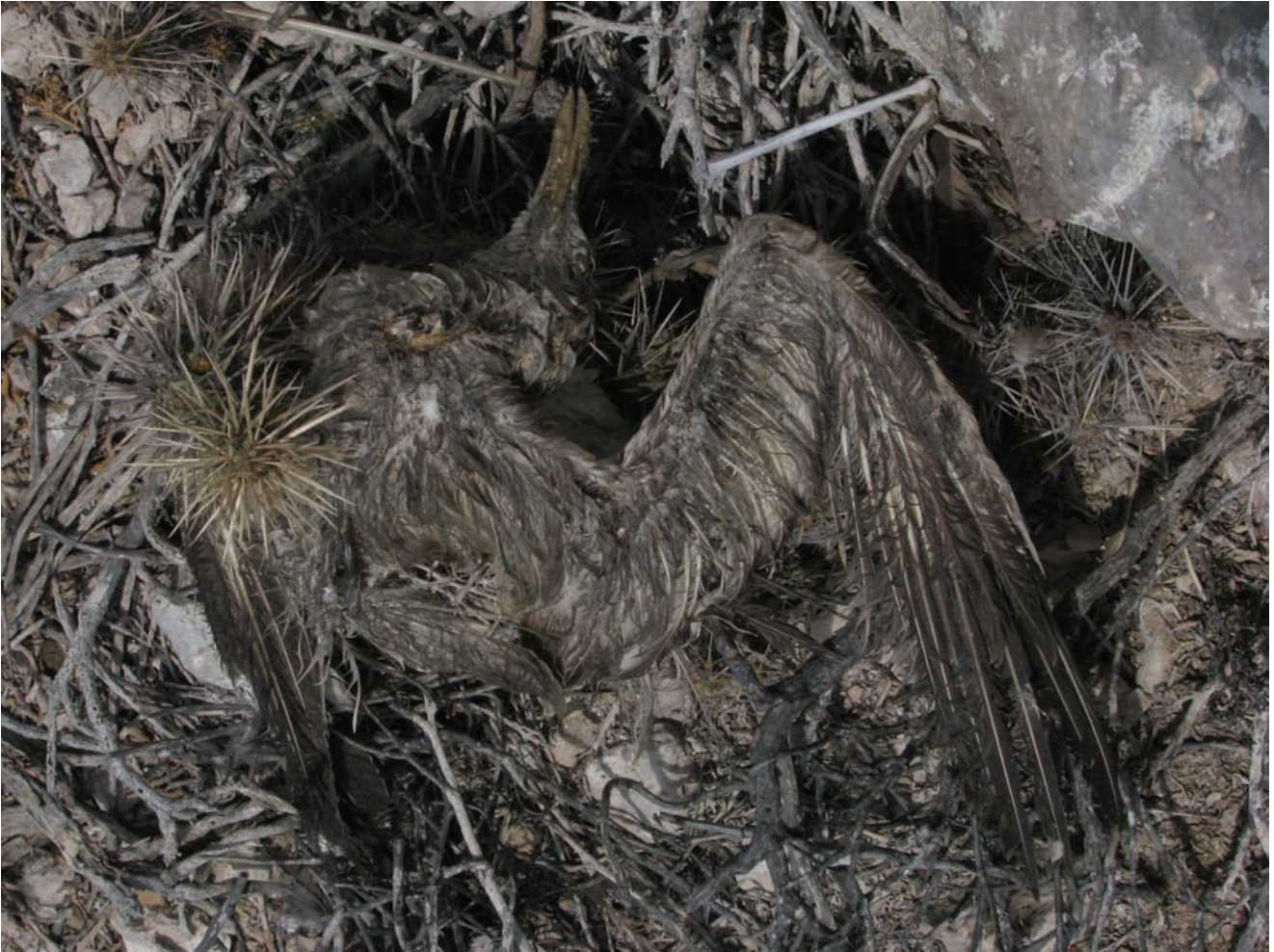
Figure 4. Elegant Tern impaled by a cholla ( Cylindropuntia fulgida ; photo by Enriqueta Velarde, 19 May 2009).

A single guayacán ( Viscainoa geniculata ) was first seen on the island in 2006 as a one-meter-tall plant, already with flowers and fruits, and by 2013 had survived with no evident increase in size. It is at the southwest end of the island, close to the shore in the first area inland with soil after the shore boulders. This is the same place where a chuckwalla was found, next to an adult cardón, adjacent to the small valley-area covered with Cressa .