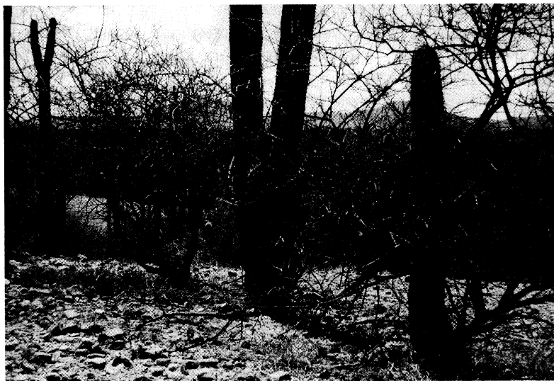
FIG. 1. Arid tropical scrub in the Tehuacán Valley, Mexico. The shrubs are Mimosa luisana and the columnar cacti are Neobuxbaumia tetetzo .

a branched columnar cactus that may reach 12 m in height, is the dominant species, with densities of c. 1200 adults \text{ha}^{-1} (adults are arbitrarily defined as individuals >1 m tall). The flowering and fruiting seasons occur from mid-May until the end of June, just before the rainy season. First reproduction occurs when the plant is c. 2 m tall. The fruits open on the plant and although some of the seeds are removed by birds, most of the seeds (1–2 mm in diameter) fall to the ground forming a relatively uniform black carpet. Under laboratory conditions, 99% of seeds germinate.