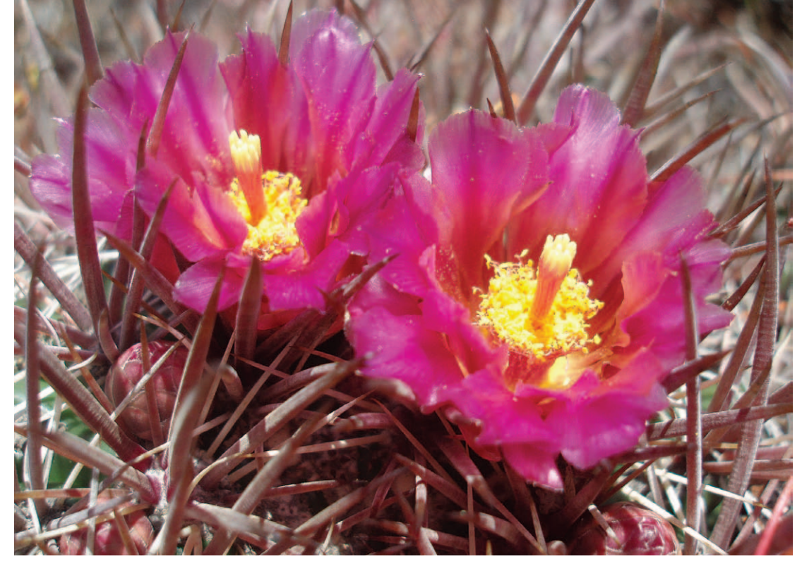
8 Ferocactus fordii is found throughout the island and in considerable numbers. The plants do not get very large, but appear to be quite old, many having various lichen species growing on their spines.

and perhaps also in plant size, with individual rosettes reaching about a meter across and flowering stems over a meter high.