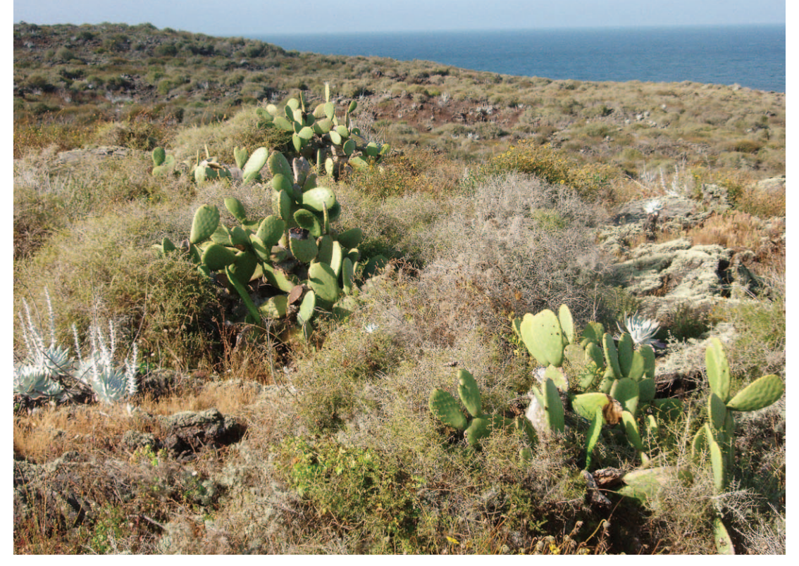
3 Opuntia ficus-indica was introduced to the island as a food source and could be affecting pollen transfer and seed set between the two native Opuntia species on San Martín Island, each known from just a single plant