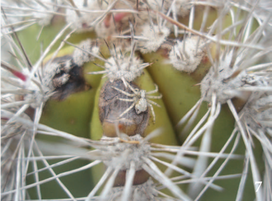
6 & 7 La senita, the old man cactus ( Lophocereus schotti ) is seen here with a crab spider hiding in its spine clusters. The failure of this one plant to reproduce suggests that it will soon be lost from the island.

of dunes and salt marsh in the southeastern corner of the island, adjacent to the small natural harbor where fisherman land. As part of the ongoing floristic study of the broader region, the island checklist developed earlier by Junak and Philbrick, is under revision (Vanderplank, Junak, & Delgadillo In Prep for Madroño). More than 100 species in total have been documented on the island; many are annuals with wind-blown seed, or coastally adapted species likely to have arrived via water.