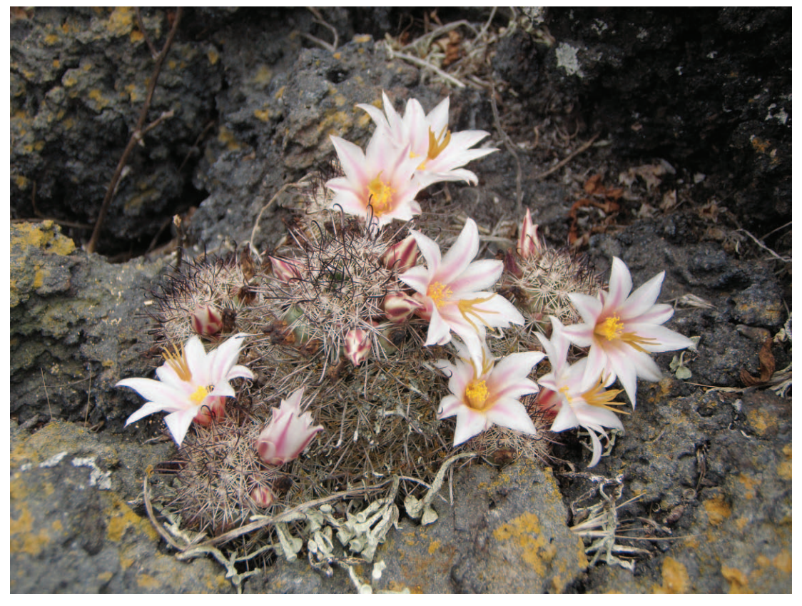
4 Mammillaria louisae flowers in the hottest months on the island and has previously been confused with other Mammillaria taxa; this species is endemic to north-west Baja California.