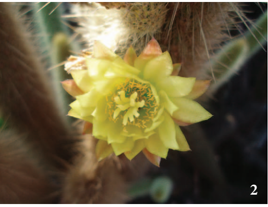
1 & 2 Bergerocactus emoryi, the golden cereus... leaving the island? Only a single clump of this species is known on San Martín Island.