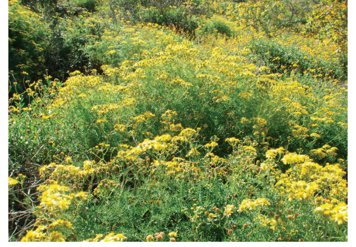
5 Senecio lyonii is globally rare and very susceptible to extirpations due to its narrow habitat requirements. It occurs in just the south-eastern corner of San Martin island.