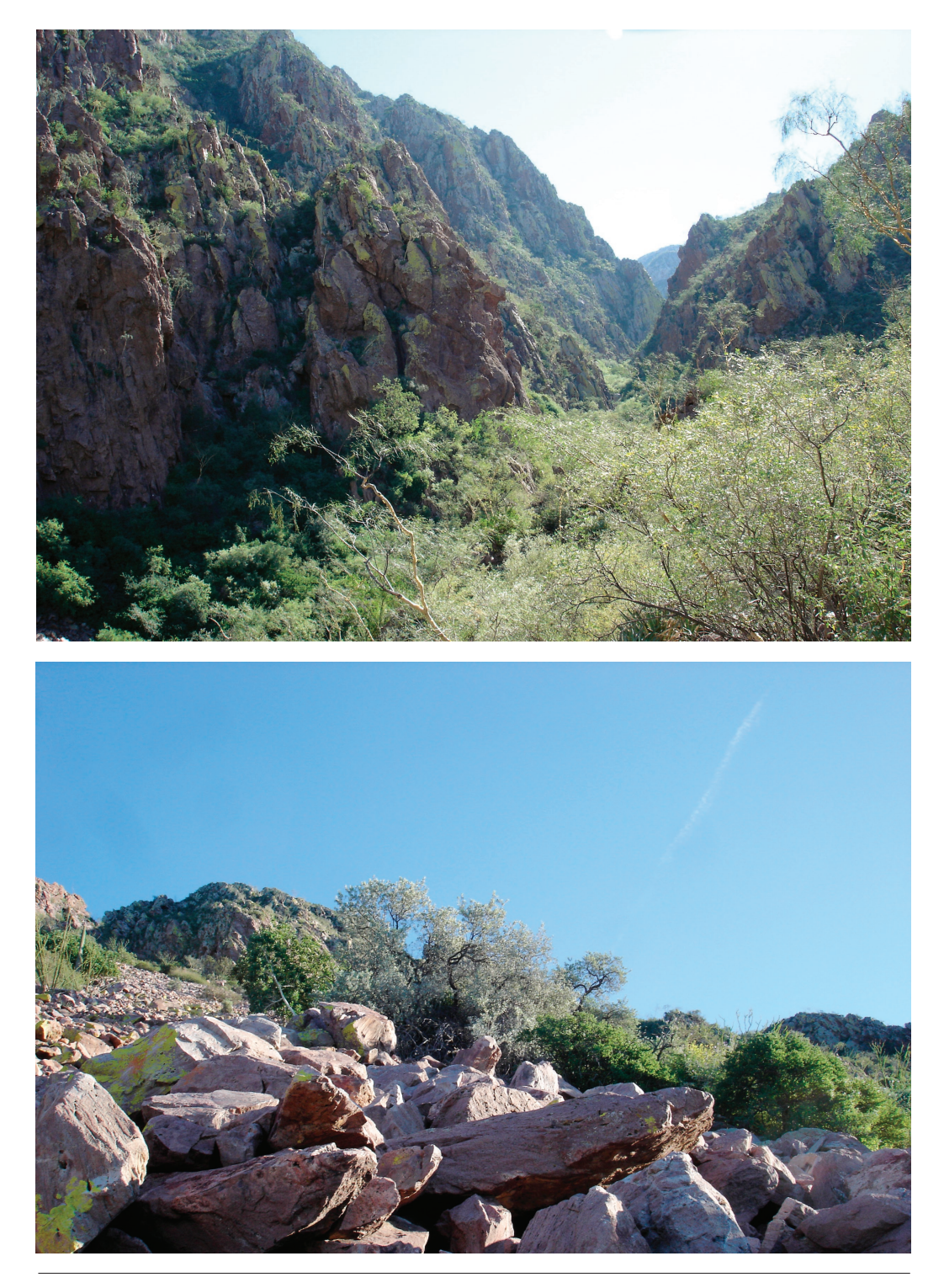
Fig. 3. Sierra Kunkaak. (A, top) Sheltered, interior canyon, ca 0.5 km up canyon from Siimen Hax waterhole. (B, bottom) Sideroxylon leucophyllum on talus slope on north side of Cerro San Miguel. Photos by Benjamin Wilder, 25 Nov 2006.