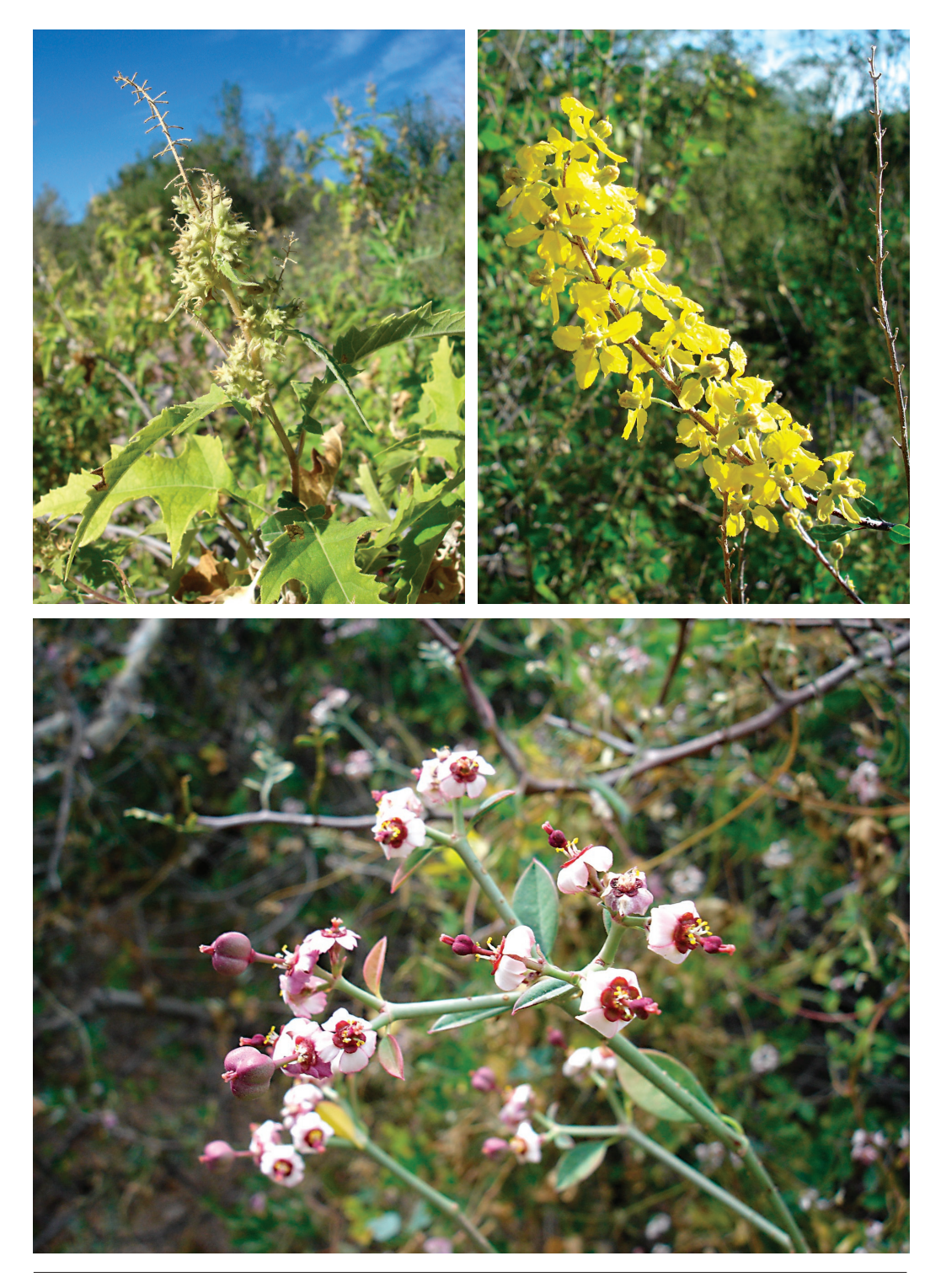
FiG. 4. New records from Sierra Kunkaak. (A, top left) Ambrosia carduacea (Wilder 06-383). (B, bottom) Euphorbia xanti (Wilder 06-453). (C, top right) Echinopterys eglandulosa (Wilder 06-377).